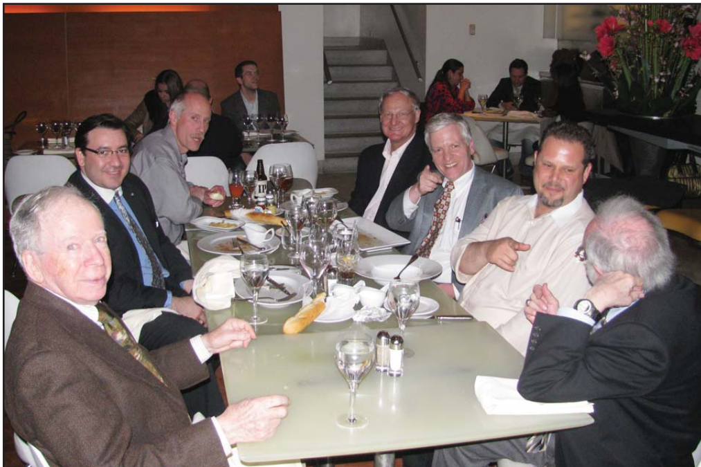
2012 ASAP Past Presidents Dinner

As ever, I am always in need of submissions for our newsletter and reviewers for books (you get to keep the book if you do a review!). Please contact me at drb@drbarclay.com should you wish to contribute or write a review!