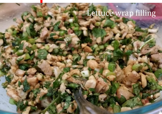
Lettuce wrap filling

Similar to our past cooking programs at the Centre City Corps' S.T.E.P.S. Program, the HIH residents learn quick and healthy recipes, nutritional tips and budgeting from volunteer instructors. Each week, they, along with the Door of Hope staff and volunteers, will prepare and cook themed lunch recipes. Through the joys of cooking and eating together, this program will not only provide in-depth lessons on life skills but also strengthen community relations.