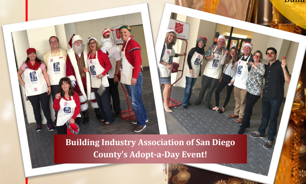
Building Industry Association of San Diego County's Adopt-a-Day Event!

Pepsi-Cola Coke Deloitte The Salvation Army Metropolitan Advisory Board Building Industry Association of San Diego