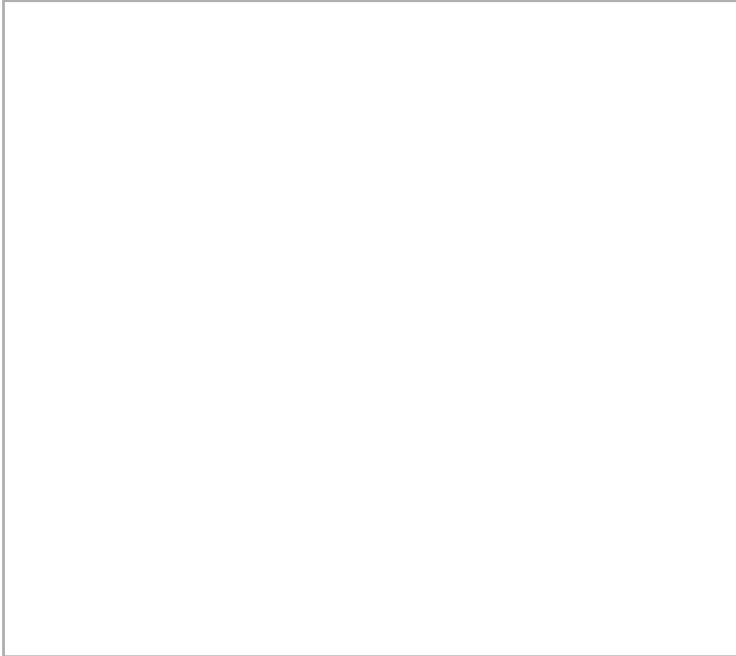
Figure 7 – Form for Creating a SHARE Requirement

Once the requirement has been reviewed and approved by the project coordinator, it will be posted in the Open for Discussion section where other people can comment on it. When discussion is completed, the requirement will be moved to the Open for Voting status, where other SHARE members will vote it on.