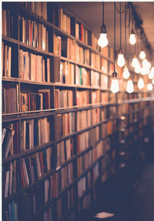
Reliability Engineering Leadership Responsibilities