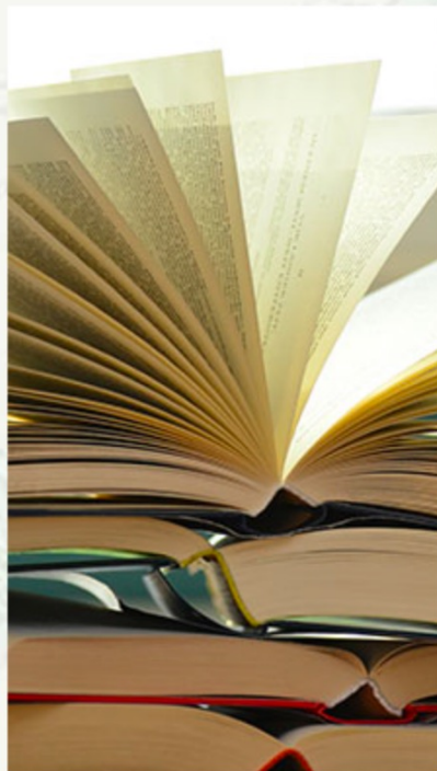
Reliability apportionment (allocation) techniques