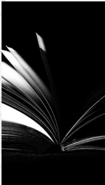
Tolerance and Worst Case Analysis