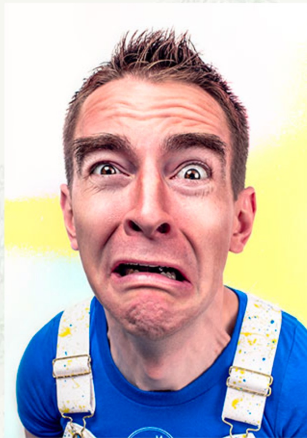
Lack of equipment