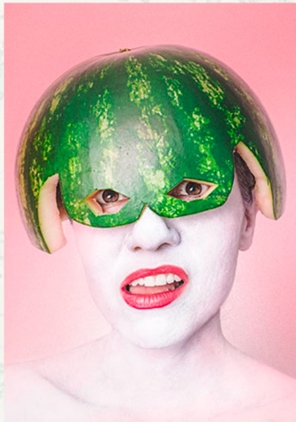
Jumping to a solution