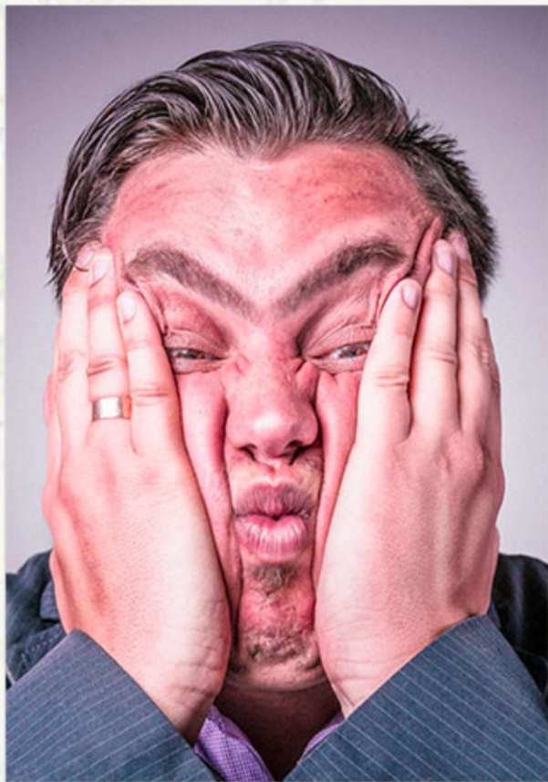
Fix it now pressure