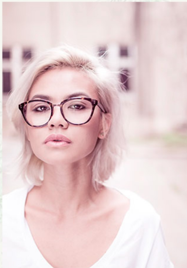
Fault Tree Analysis