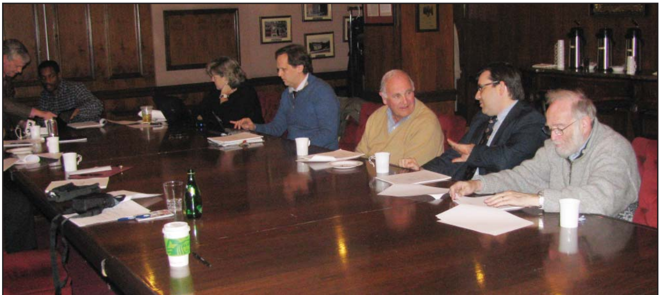
ASAP Governing Board Meeting