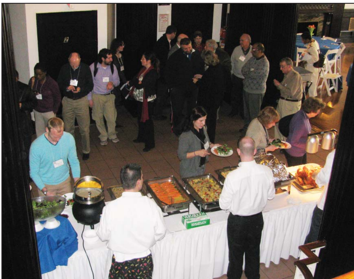
Welcome Reception 2011 Annual Meeting