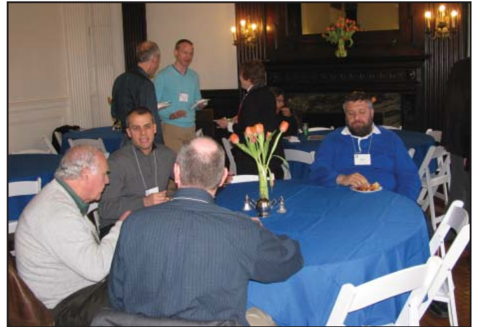
Lunch at the 2011 Annual Conference