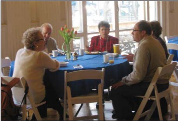
Lunch at the 2011 Annual Conference