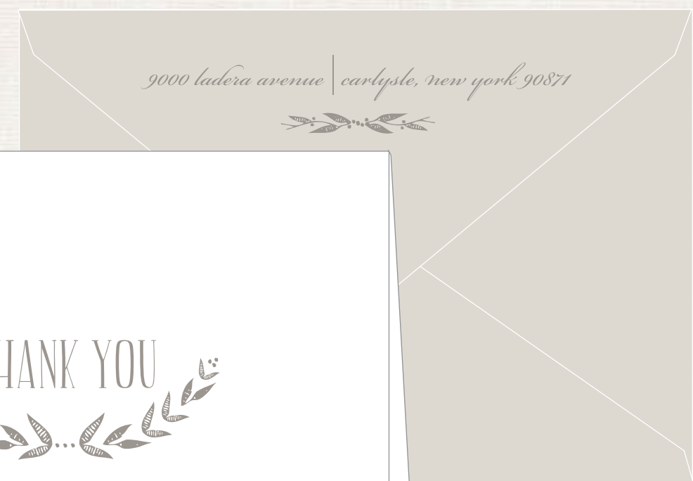
THANK YOU CARD ENVELOPE (4BAR)