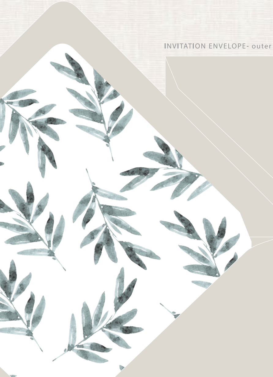
INVITATION ENVELOPE- outer (A7)