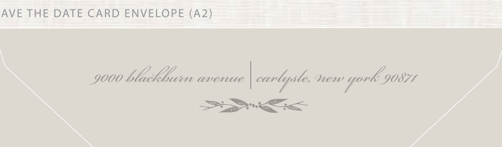
SAVE THE DATE CARD ENVELOPE (A2)