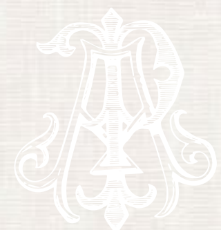
TABLE NUMBER (4 x 6)