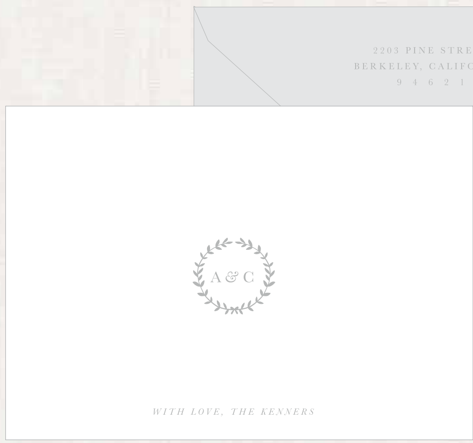
THANK YOU CARD (4.875 x 3.5)