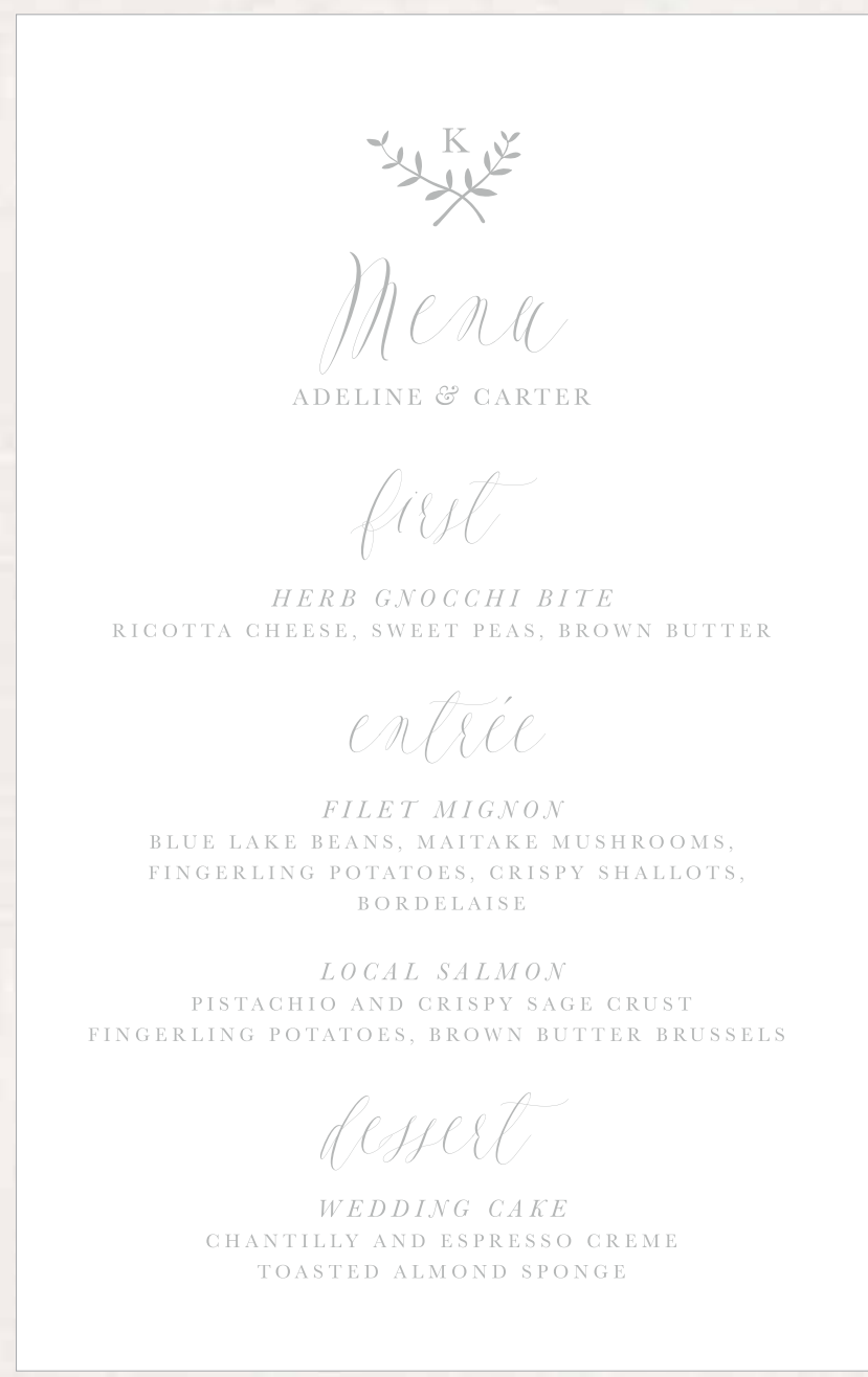
MENU CARD (4.25 x 6.75)