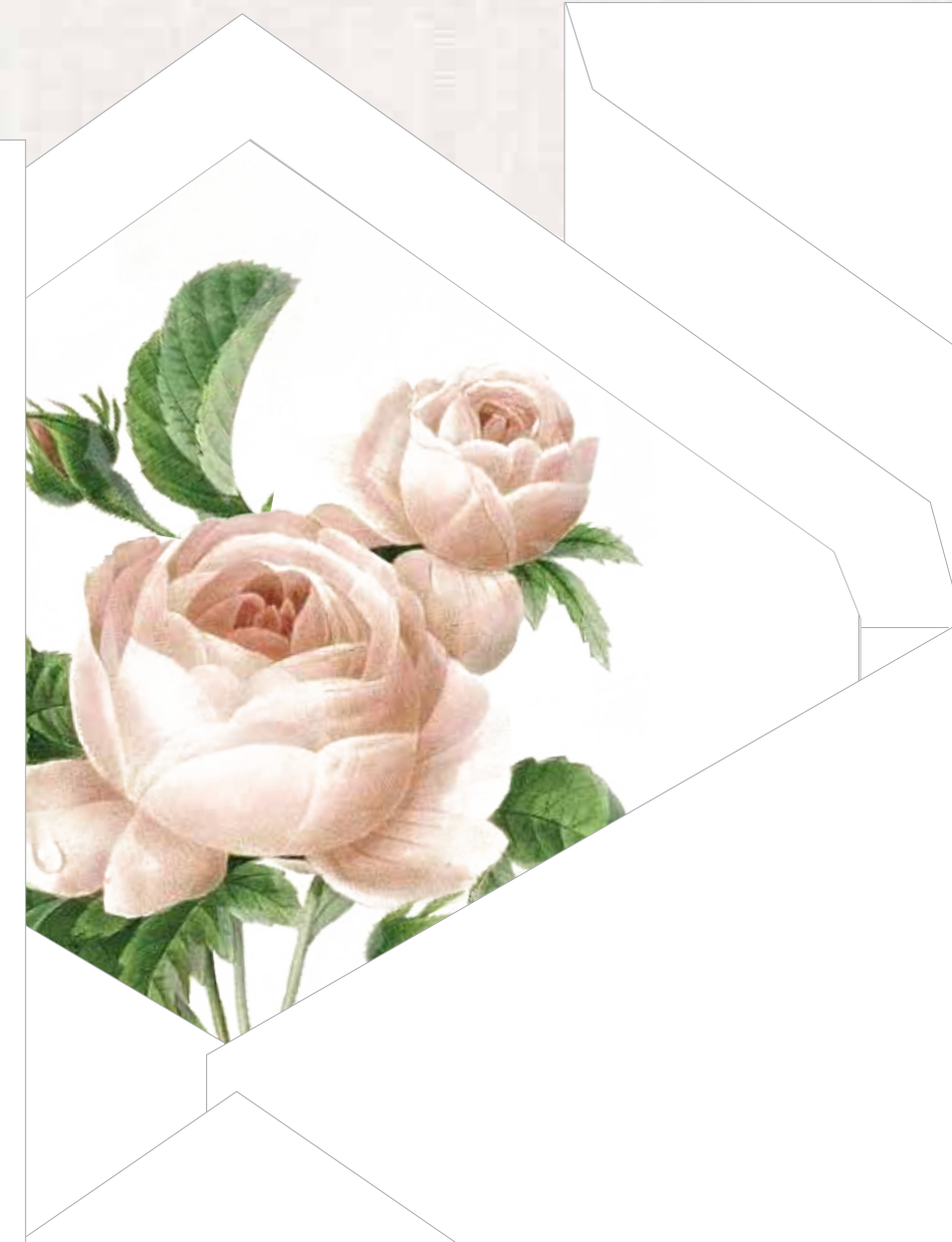
INVITATION ENVELOPE- outer (A7)