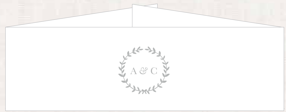
BELLYBAND (1.5 x 10.5)