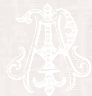
TABLE NUMBER (4 x 6)