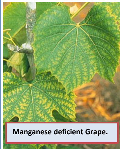
Manganese deficient Grape.