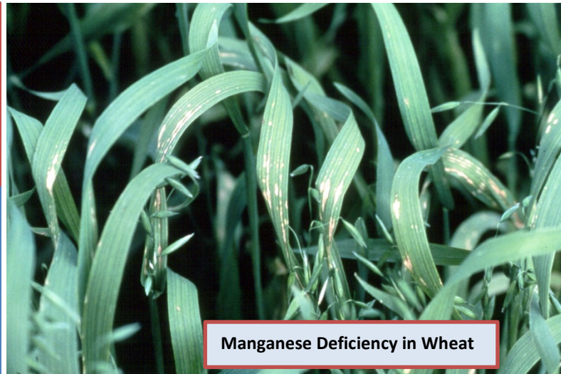
Manganese Deficiency in Wheat

Symptom Description — Manganese is immobile in the plant, so its deficiency appears as reduced or stunted growth with visual interveinal chlorosis on younger leaves. Cereals can develop gray spots on their lower leaves, and legumes can develop necrotic areas on their cotyledons. Soybeans and potatoes commonly show interveinal chlorosis on the upper leaves, while veins remain green. Leaves become pale green first, then pale yellow. As deficiency becomes more severe, brown, dead areas appear.