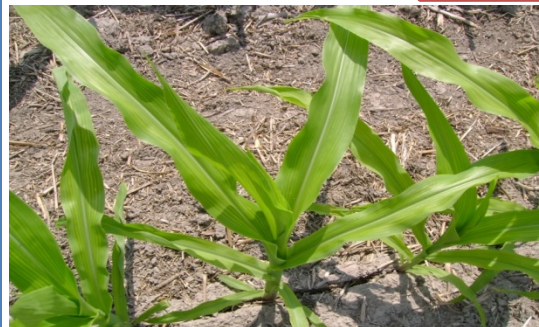
Manganese deficiency in Corn showing typical interveinal chlorosis.