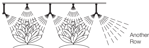
Application to Mid-size Plants (3 to 5 weeks after transplanting)