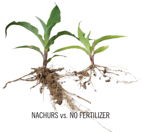
NACHURS vs. NO FERTILIZER

FIRST AID: Please see MSDS sheet for more information, call (800) 622-4877 or visit us online at www.nachurs.com .