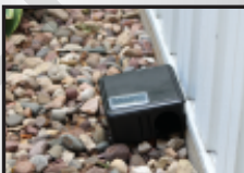
EXTERIOR OF HOMES

Must adhere to the USE RESTRICTIONS in the DIRECTIONS FOR USE section of this label.