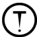
D2B - Toxic