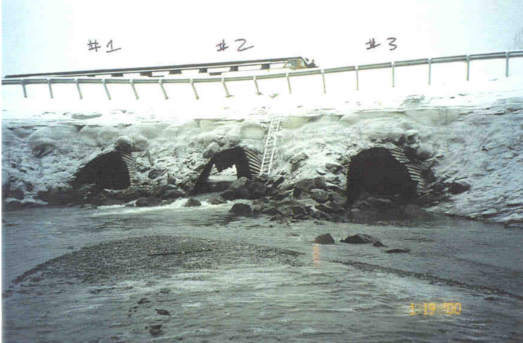
Photo 1: Downstream side of three existing culverts and embankment failure.