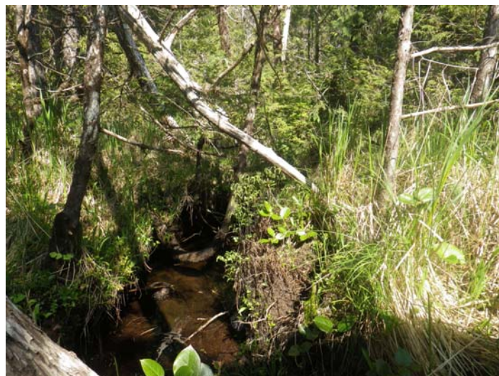
Photo 1. The end of reach 2 on stream 1 of Manhattan Lake.

Reach 1 was classified as FPS (narrow low gradient flood plain channel), Reach 2 was classified as FPO (micro flood plain channel). No anadromous fish were trapped in Reach 2; however Dolly Varden were found in the trap. Reach 2 became a muskeg, and is unlikely fish habitat.