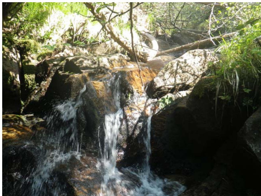
Photo 2. Waterfall at the end of Reach 5