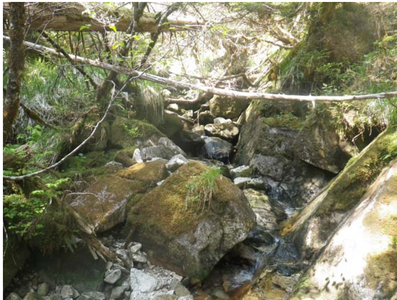
Photo 1. Waterfall at the end of Reach 4

Reaches 1 and 2 were classified as MMS (small moderate gradient mixed), Reach 3 was MCS (small moderate gradient contained channel) and Reaches 4 and 5 were classified as HCLw (low incision, high gradient, wetland phase). Reach 6 (lower in the system) was classified as FPS (narrow low gradient flood plain channel). Two barriers, waterfalls, were documented at the end of Reach 4 and Reach 5 (see attached figure). The waterfall on Reach 4 was 2.5 meters high with a 45% gradient (photo 1). The waterfall on Reach 5 was 2.5 meters high with a 45% gradient (photo 2).