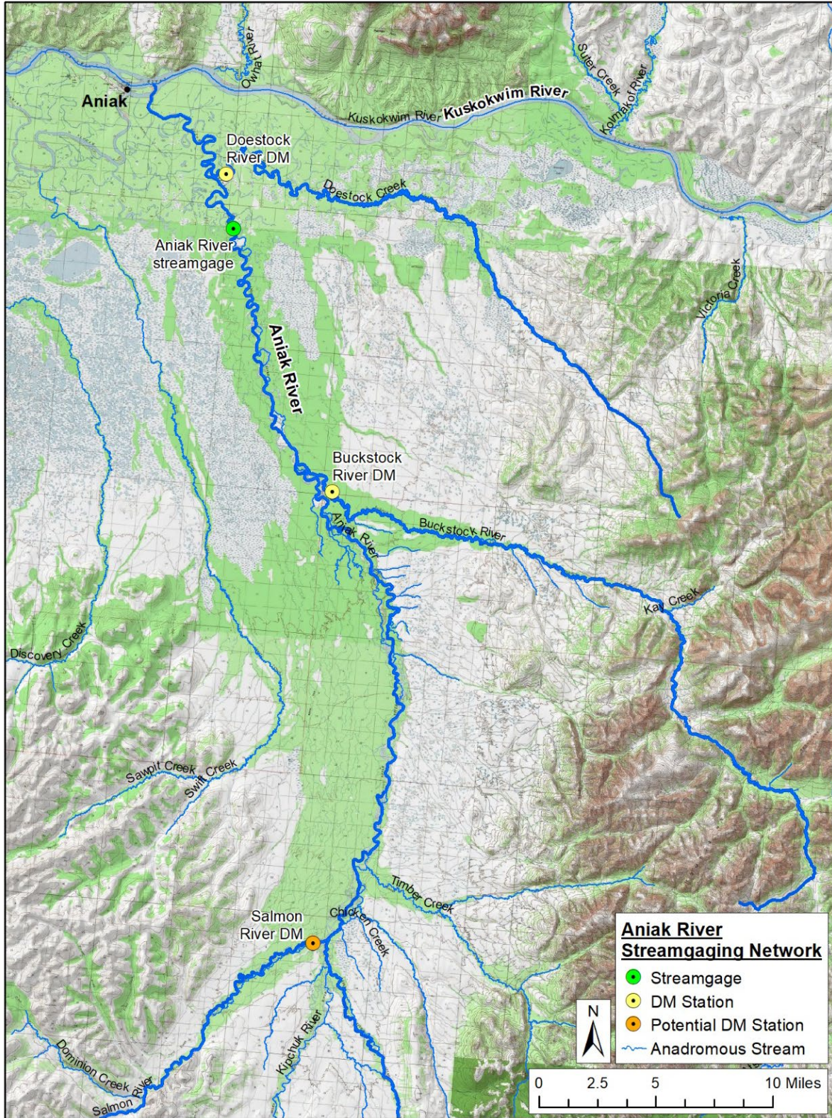
Figure 2.—Location of Aniak River streamgaging and discharge measurement (DM) stations in the Aniak River watershed.