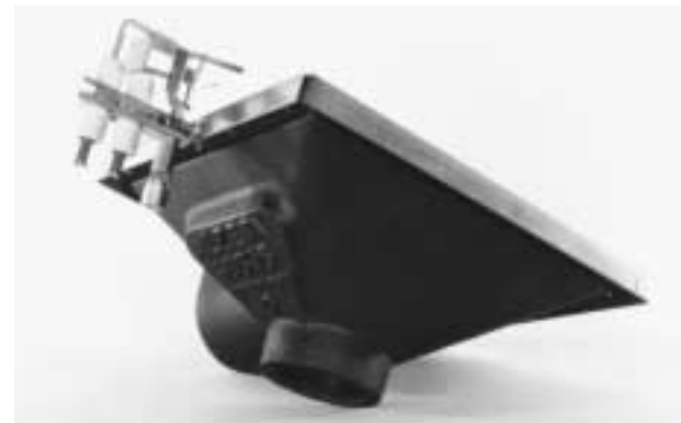
Pyromat SB™ Modules showing gas pilot assembly and remote flame rod (patent pending).