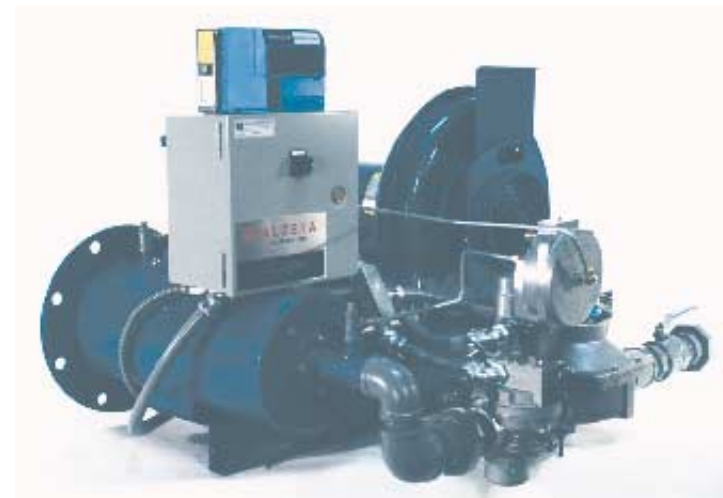
Pyromat SB™ Fuel Air Delivery Module.