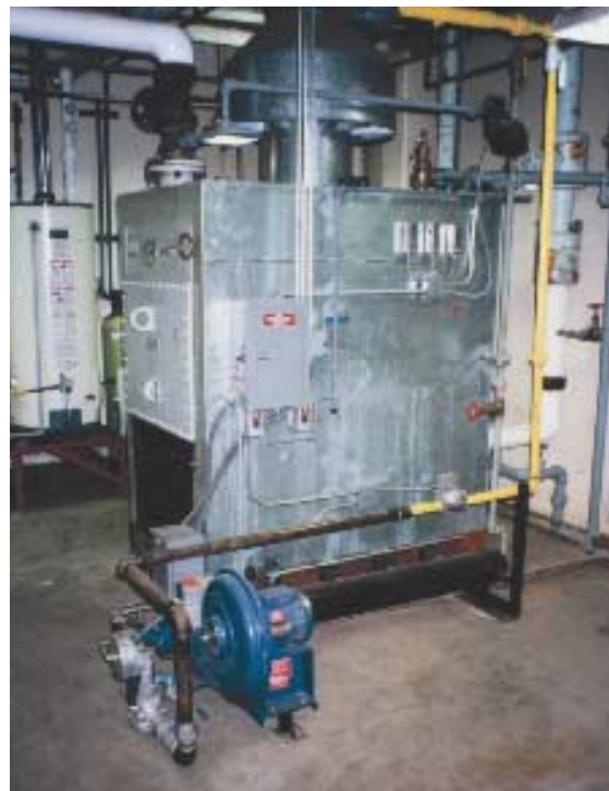
Pyromat SB™ Model SB505/4-1-IGC Burner installed in Atmospheric Boiler.