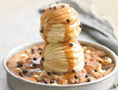
SALTED CARAMEL PIZOOKIE®