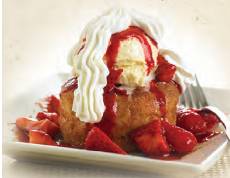
BJ's BAKED BEIGNET