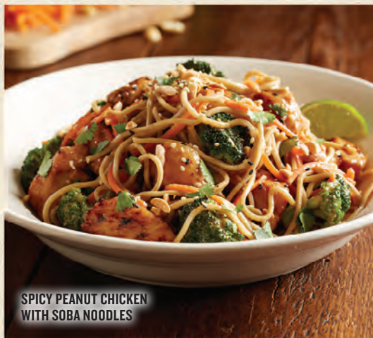
SPICY PEANUT CHICKEN WITH SOBA NOODLES

Blackened chicken breast | sautéed shrimp | chicken-andouille sausage | bell peppers | white onions | tomatoes | Cajun-spiced broth | rice pilaf (cal. 1140) | 18.25