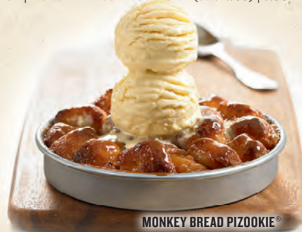
MONKEY BREAD PIZOOKIE®

Fresh-baked, pull-apart bread | butter | brown sugar | cinnamon | rich vanilla bean ice cream (cal. 1260) | 7.50