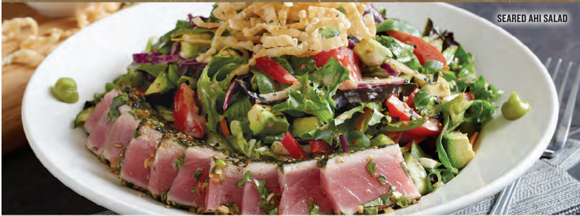
SEARED AHI SALAD

IT'S NOT TAKING THINGS OUT THAT MAKES THEM ENLIGHTENED. IT'S PUTTING THE RIGHT THINGS IN.