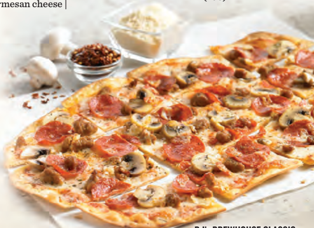
BJ's BREWHOUSE CLASSIC