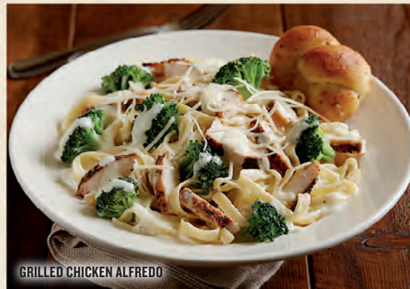
GRILLED CHICKEN ALFREDO

Herb-roasted, grilled chicken | fettuccini | creamy alfredo | steamed broccoli | Parmesan cheese (cal. 1380) | 15.75