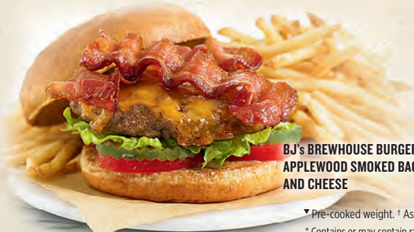
BJ's BREWHOUSE BURGER WITH APPLEWOOD SMOKED BACON AND CHEESE

Hot off the flat top and packed with flavor! Our 5 oz.* diner burgers are made with fresh ground beef and grilled onions and then served on a Parmesan-crust bun.