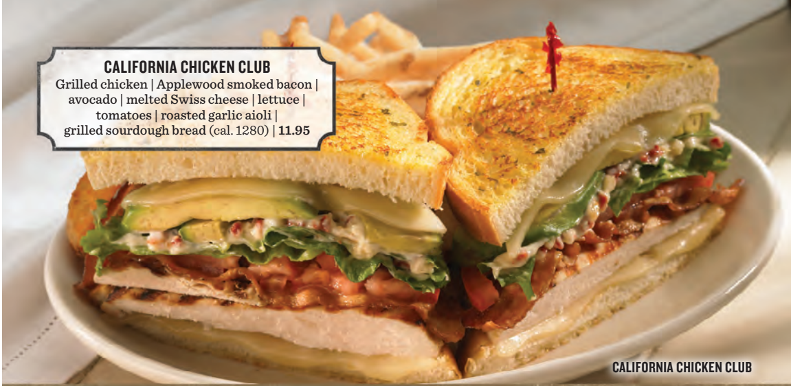
CALIFORNIA CHICKEN CLUB

Grilled chicken | Applewood smoked bacon | avocado | melted Swiss cheese | lettuce | tomatoes | roasted garlic aioli | grilled sourdough bread (cal. 1280) | 11.95