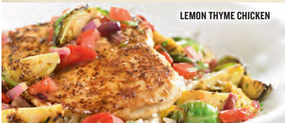
LEMON THYME CHICKEN

Oven-roasted mahi-mahi | Big Poppa Smokers' Desert Gold rub | sautéed shrimp | couscous in a light Mediterranean broth | red onions | tomatoes | Kalamata olives | spicy garlic (cal. 550) | 15.50