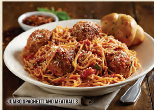
JUMBO SPAGHETTI AND MEATBALLS