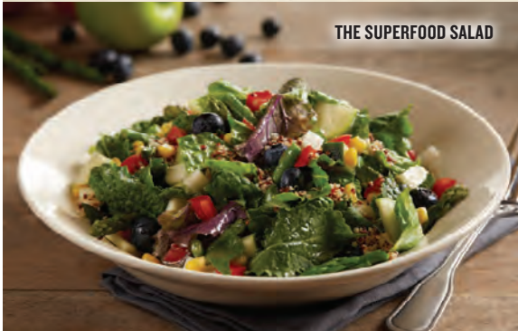
THE SUPERFOOD SALAD

Using ingredients from around the world, we've created these nutrient-packed dishes that nourish your body and your mind.