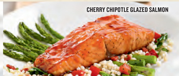
CHERRY CHIPOTLE GLAZED SALMON