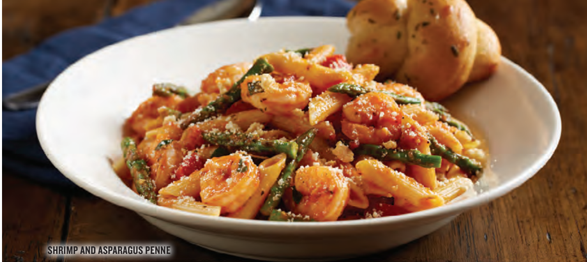
SHRIMP AND ASPARAGUS PENNE