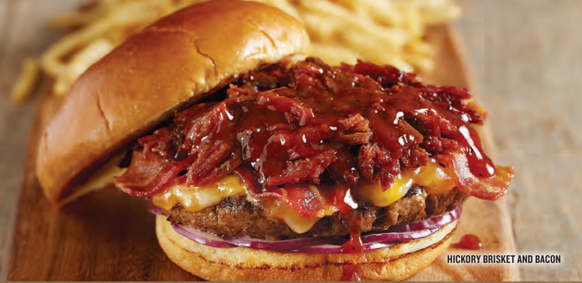
HICKORY BRISKET AND BACON