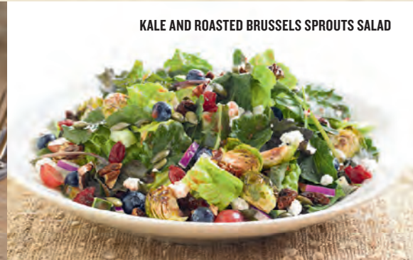
KALE AND ROASTED BRUSSELS SPROUTS SALAD

With flame-broiled or blackened salmon* (cal. 850/870) | 16.25