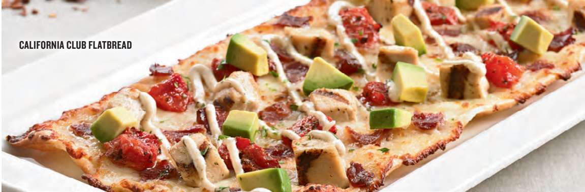
CALIFORNIA CLUB FLATBREAD