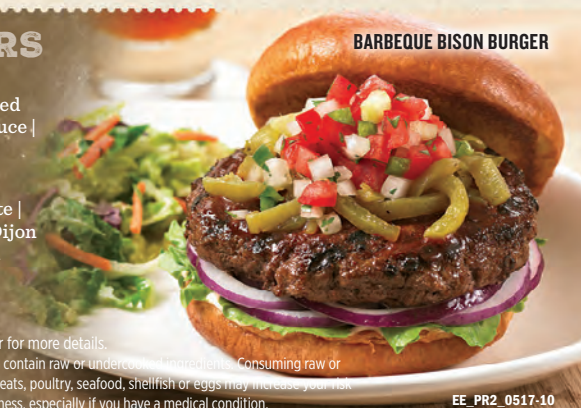
BARBEQUE BISON BURGER

2,000 calories a day is used for general nutrition advice, but calorie needs vary.