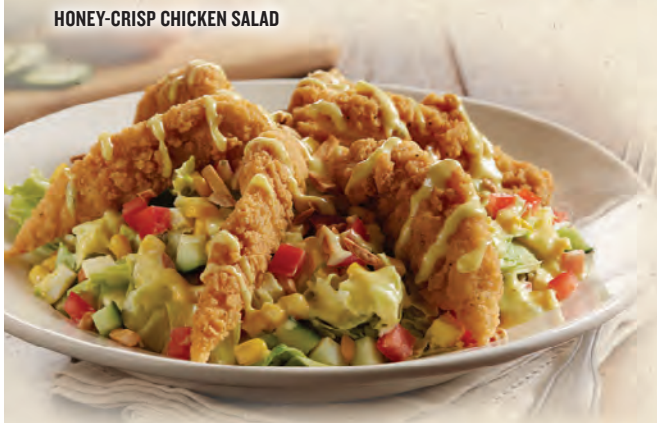
HONEY-CRISP CHICKEN SALAD

With flame-broiled or blackened salmon* (cal. 1200/1220) | 15.95