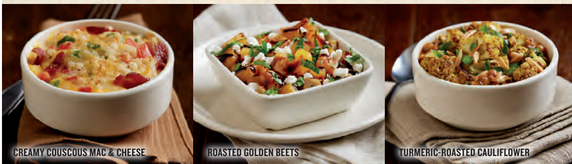
CREAMY COUSCOUS MAC & CHEESE

Pick three of your favorites for only 11.75.