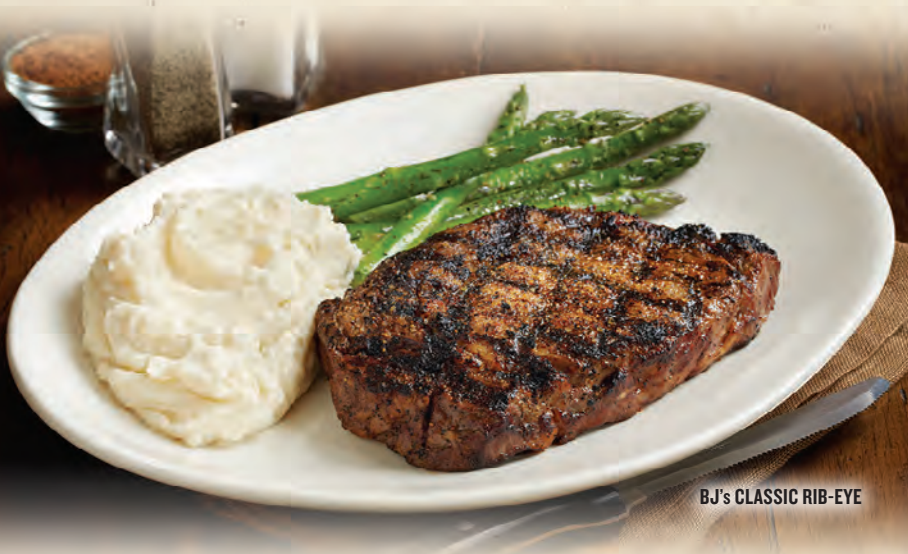
BJ's CLASSIC RIB-EYE