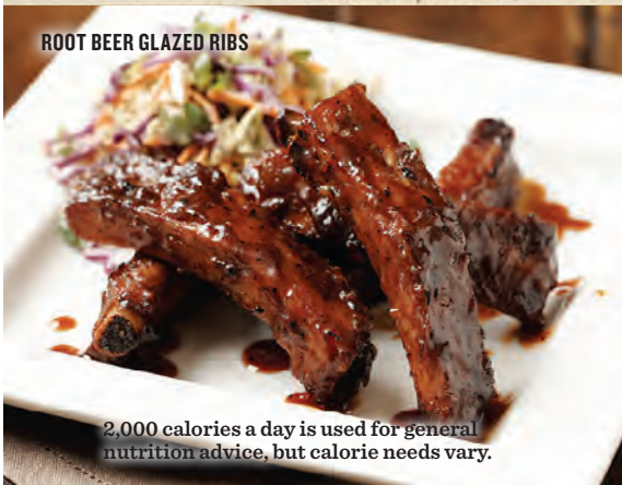
ROOT BEER GLAZED RIBS

Crispy, bone-in wings | drizzled with Hot and Spicy Buffalo + ranch | celery sticks | extra sauce for dipping (cal. 820) | 11.95