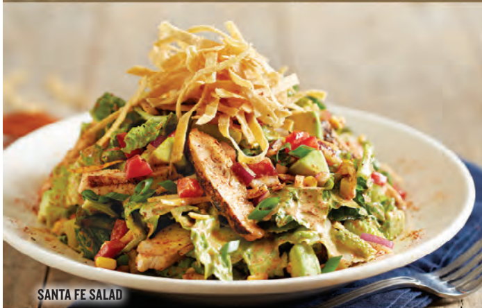
SANTA FE SALAD