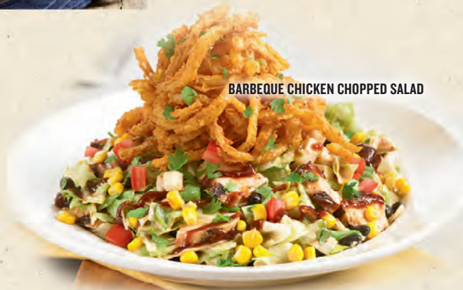
BARBEQUE CHICKEN CHOPPED SALAD

Crisp romaine | iceberg lettuce | lightly fried chicken tenders | toasted almonds | cucumber | hard-boiled egg | sweet corn | tomatoes | honey mustard dressing (cal. 1370) | 13.95