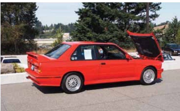
Keith Fournier's very clean E30 M3.

LOVE your car but HATE door dings? Paintless Dent Repair may be for you!