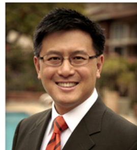
John Chiang Treasurer, State of California