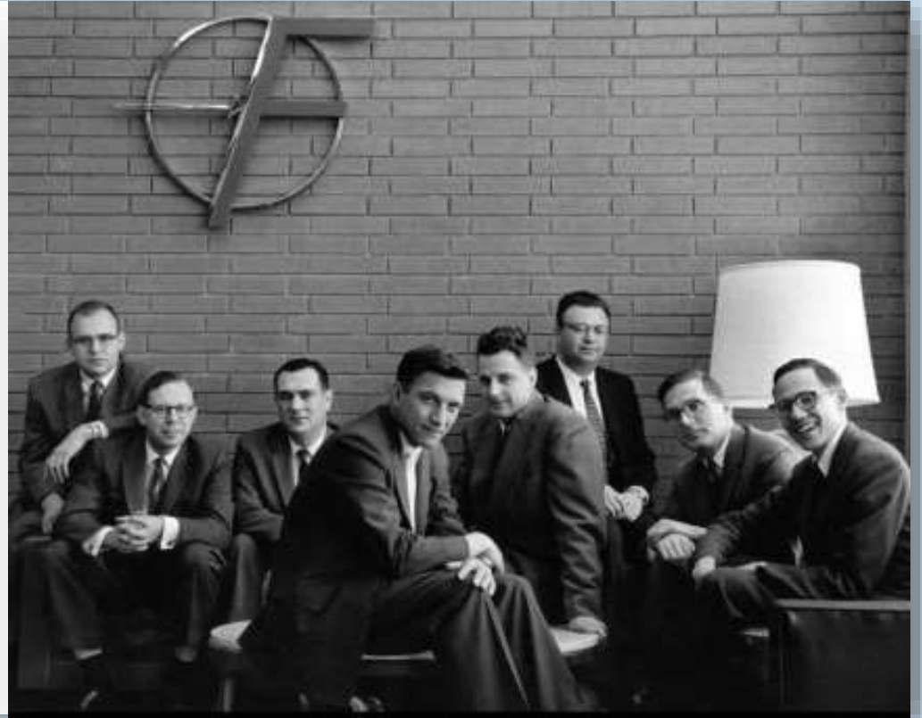
Gordon Moore and Robert Noyce Intel Founders