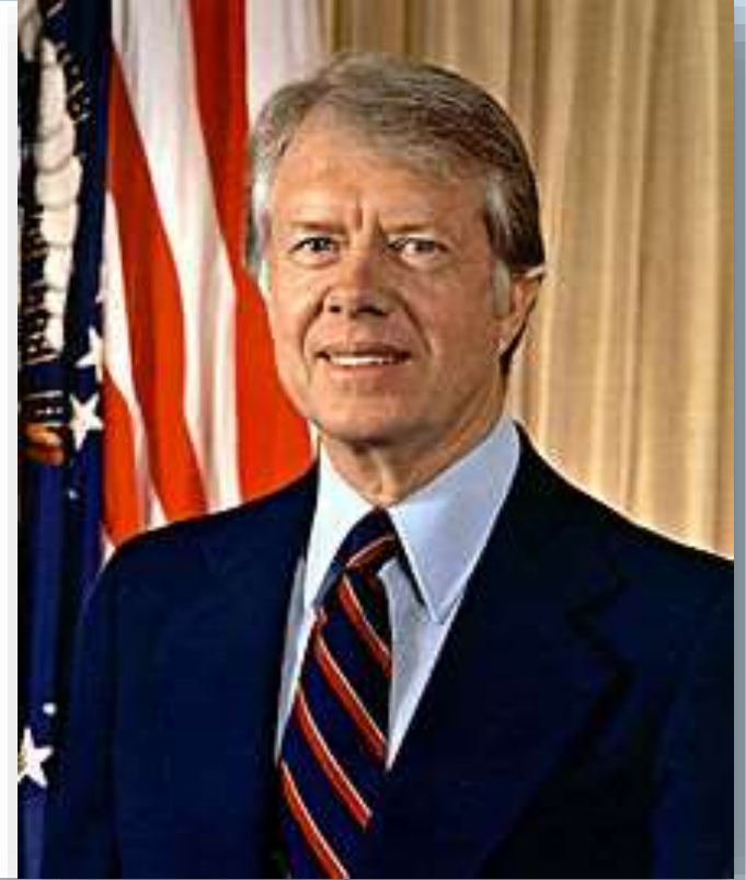
Jimmy Carter 39th President of the United States

– Ellen Johnson Sirleaf, President of Liberia and first elected female head of state in Africa