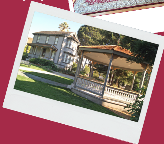
The Gardens and Gazebo 150 seated