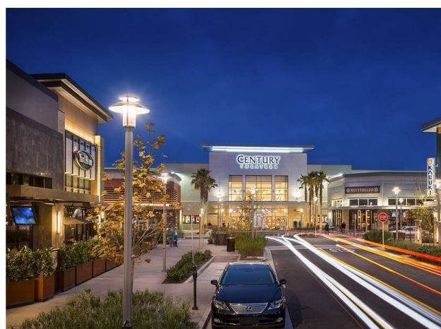
The Collection at RiverPark, Oxnard, above The Huntington, left

Home to more than 120 name-brand outlets and value retailers plus great dining and entertainment options. The center also features a unique collection of upscale outlets including Bloomingdale's - The Outlet Store, Neiman Marcus Last Call, Nordstrom Rack and Saks Fifth Avenue OFF 5 TH . simon.travel