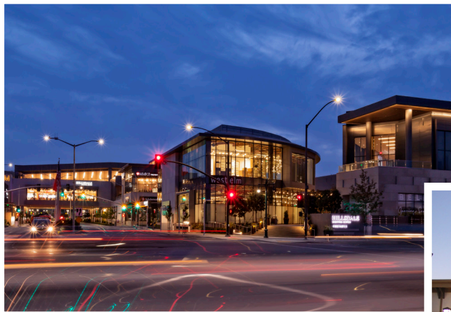
Hillsdale Shopping Center, above San Francisco Premium Outlets, right

Located in the Tri-Valley, just 40 miles from downtown San Francisco next to California's oldest wine region, the Livermore Valley. Visit 180 iconic brands and designer names in California's largest outdoor outlet shopping mall. Guests will love shopping for great deals at stores like Prada, Gucci, Burberry, Coach and more. simon.travel