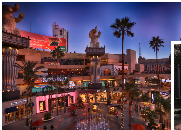
Hollywood & Highland, above La Cumbre Plaza, right

Conveniently located between Los Angeles and Orange Counties, Los Cerritos Center offers more than 185 apparel and specialty shops including Nordstrom, Zara, Disney, Banana Republic, Morphe, Apple and more. While visiting, enjoy a movie at Harkin's Theatres and a meal at The Cheesecake Factory, PF Changs or California Pizza Kitchen. Questions? Text Concierge at (562) 383-2333. ShopLosCerritos.com