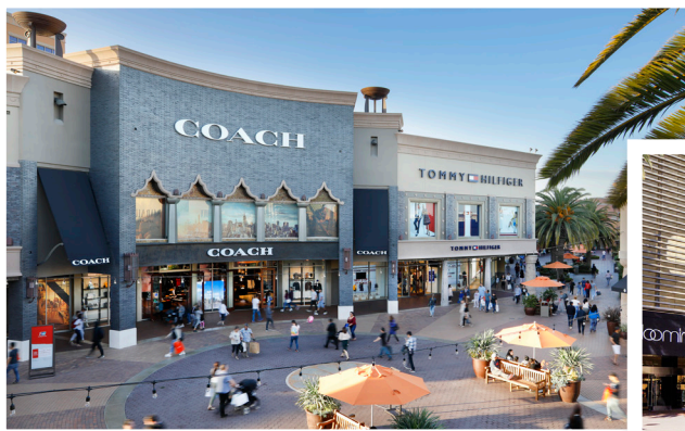
Citadel Outlets, above Fashion Island, right

Hollywood & Highland is Los Angeles' modern shopping, dining and entertainment destination for both locals and tourists, located on iconic Hollywood Boulevard. You'll find over 75 shops, restaurants and entertainment attractions like the Dolby Theatre - home of the Oscars®. HollywoodandHighland.com