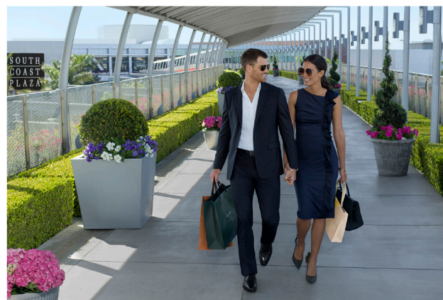
South Coast Plaza, above Santa Monica Place, left