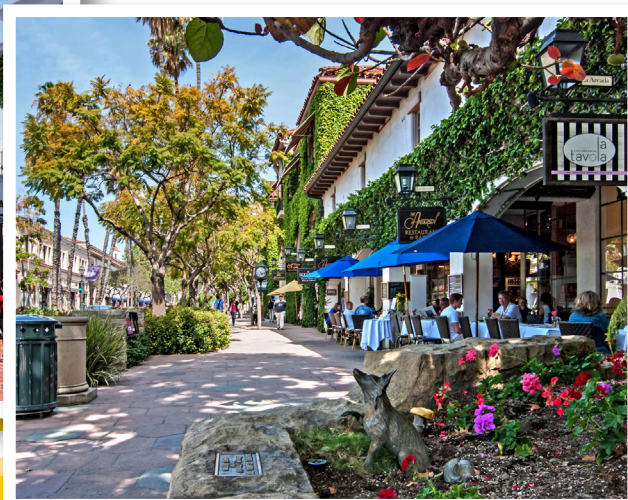
Santa Barbara State Street, right Paseo Nuevo, above