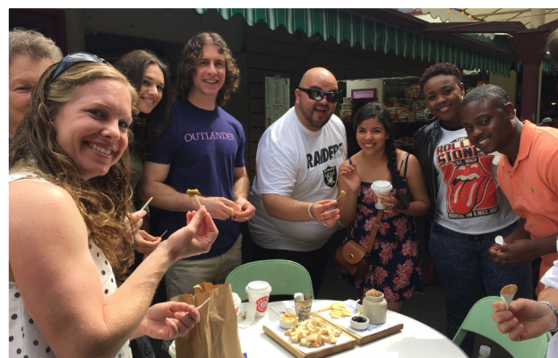
Melting Pot Food Tours, above Lido Marina Village, left