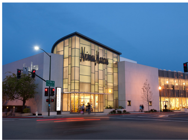
Broadway Plaza, above Arden Fair, left

In the heart of Silicon Valley, minutes from the San Jose International Airport and Levi's Stadium, Great Mall® is the largest enclosed outlet destination in Northern California. True to its name, this newly renovated center has over 200 stores. Only here can you shop the biggest brands – from Tommy Hilfiger and UNIQLO to True Religion Outlet – at the biggest value, up to 70% off. Come discover all the ways that Great Mall has style, savings and fun covered for the whole family. simon.travel