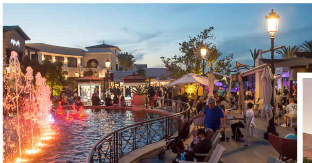
The Veranda, above Village at Corte Madera, right

Located at the edge of Beverly Hills and West Hollywood in Los Angeles, Beverly Center is home to over 100 stores featuring the best in luxury, contemporary and fast fashion favorites all under one magnificent skylight. The center is home to an unparalleled collection of luxury brands including Balenciaga, Burberry, Gucci, Louis Vuitton, Prada, Saint Laurent and The Webster, unique contemporary brands including COS, Sandro and Maje and an expanded fast fashion collection with Los Angeles' largest Zara, H&M and Uniqlo. Located on the ground floor of Beverly Center, foodies and food lovers alike will enjoy a one-of-a-kind lineup of chef-driven restaurants and fast-casual eateries including ABSteak by Chef Akira Back, a revolutionary modern Korean Steakhouse incorporating American-style steakhouse with Korean flavors; Angler, a seafood, wood fire and fun dining experience by three-star Michelin Chef Joshua Skenes and L.A.'s cult favorite, Eggslut. BeverlyCenter.com