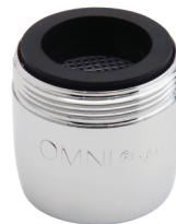
Dual thread housing