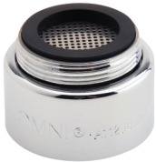
Male vandal resistant thread housing