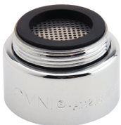
Male vandal resistant thread housing