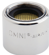
Female vandal resistant thread housing