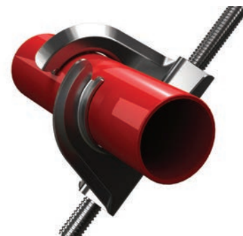
Structural Attachment for Restraint (Sway Brace) Patent Pending