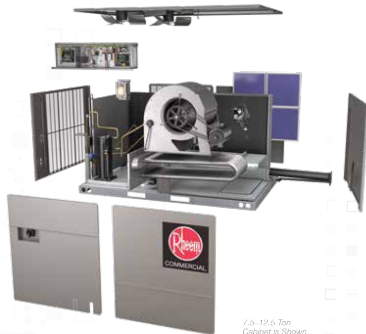
7.5-12.5 Ton Cabinet is Shown

From new construction to replacement projects and more, the new Rheem® Commercial Renaissance™ Line offers a breadth of commercial heating and cooling products that meet all design and application requirements. Whether your business is retail, hotels, restaurants, offices, schools, senior care or gyms, you'll have the ability to connect a new, customized Renaissance unit quickly and efficiently, providing comfort and peace-of-mind.