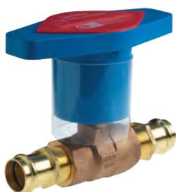
UPBA-400 P2 TIH