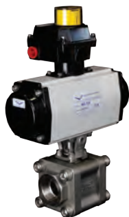
35 SERIES BALL VALVE WITH PNEUMATIC ACTUATOR