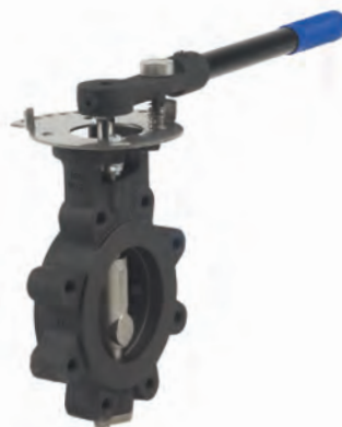
HPILCS WITH LEVER HANDLE

Cast Iron Body, Lug Style, Aluminum Bronze Disc, EPDM Liner, Bi-Directional Dead-End Service 200 psig Max 2" thru 12", Uni-Directional Dead-End Service 150 psig Max, 14" thru 24", IAPMO Tested and certified against NSF/ANSI 372 for "Lead-free" compliance.