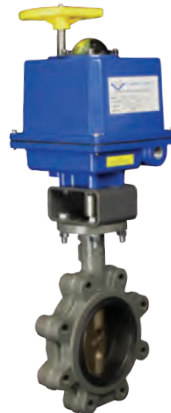
CL SERIES BUTTERFLY VALVE WITH ELECTRIC ACTUATOR

Available on 150 and 300 lbs. Class Valves Available on 1/2" thru 12" Valves