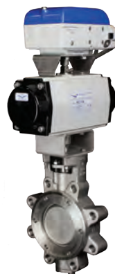
HP SERIES LUG BUTTERFLY VALVE WITH PNEUMATIC ACTUATOR