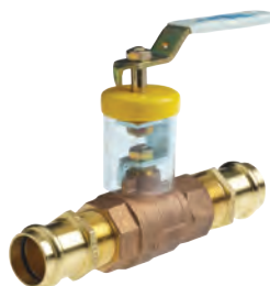
UPBA-100 P2 XH