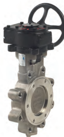
HPILSS WITH GEAR OPERATOR