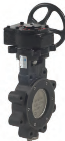
HPILCS WITH GEAR OPERATOR