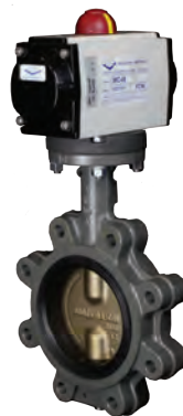
ML SERIES BUTTERFLY VALVE WITH PNEUMATIC ACTUATOR

Available on 150 and 300 lbs. Class Valves. Available on 1/2" thru 12" Valves.