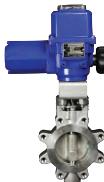
HP SERIES LUG BUTTERFLY VALVE WITH ELECTRIC ACTUATOR