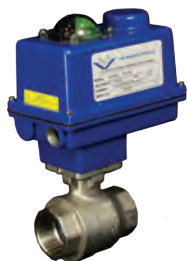
BA-260 BALL VALVE WITH ELECTRIC ACTUATOR