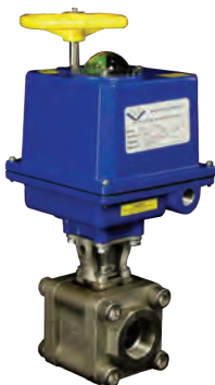
35 SERIES BALL VALVE WITH ELECTRIC ACTUATOR