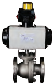
F20 SERIES BALL VALVE WITH PNEUMATIC ACTUATOR WITH LIMIT SWITCH