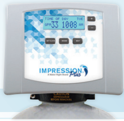
Impression Plus® model shown with backlit display and top flange