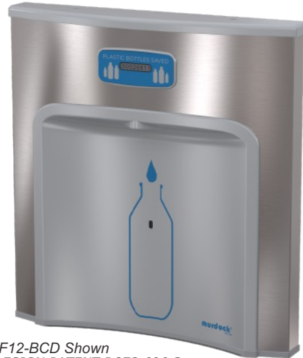
Model BF12-BCD Shown **U.S. DESIGN PATENT D873,606 S