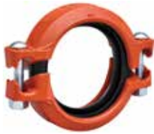
2 – 12"/DN50 – DN300