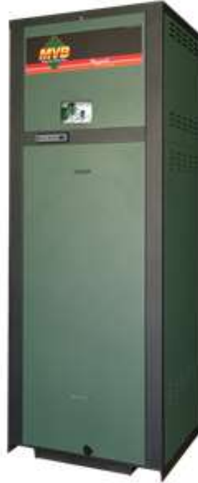
MVB - up to 87% - Vent Category II/IV