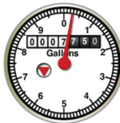
FIGURE 1 Meter register

Step 5: Calculate the total random and systematic uncertainties separately. Using Eqs 2 and 3, the total random uncertainty, s_R , and the systematic uncertainty, b_R , are calculated as follows: