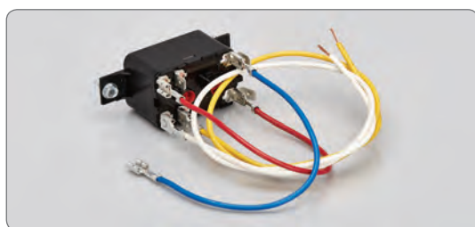
Heat Pump Relay