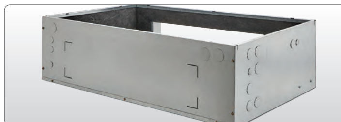
Field Assembled Case