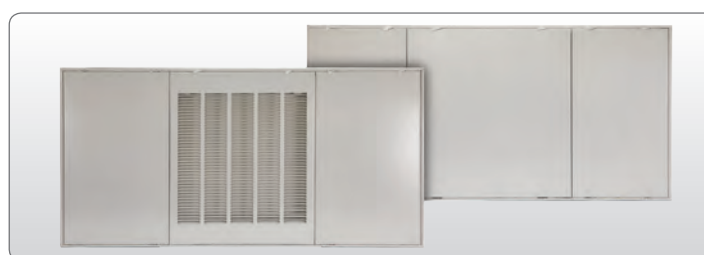
Louvered or Non-louvered Panel