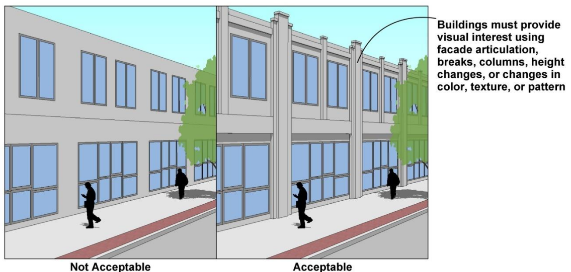
Figure 17.7.1: Façade Design