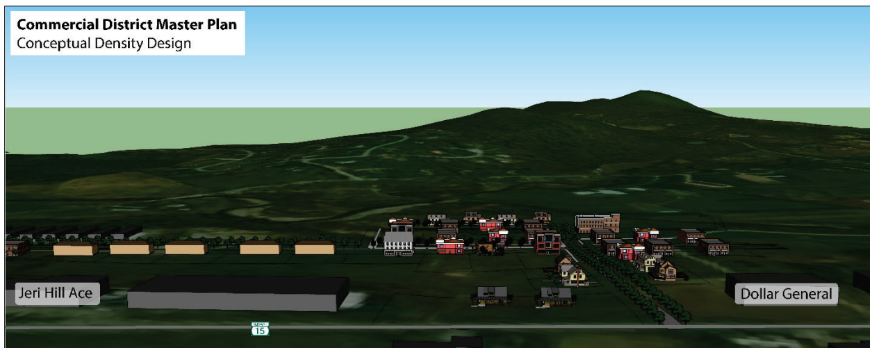
FIGURE 1: CONCEPTUAL DENSITY DESIGN

It is important to recognize that these maps and images are not intended to be replicated exactly. Instead, it is the principles that they demonstrate that should be considered and, once the draft Master Plan has been finalized after sufficient public input, incorporated into the Jericho Town Plan.