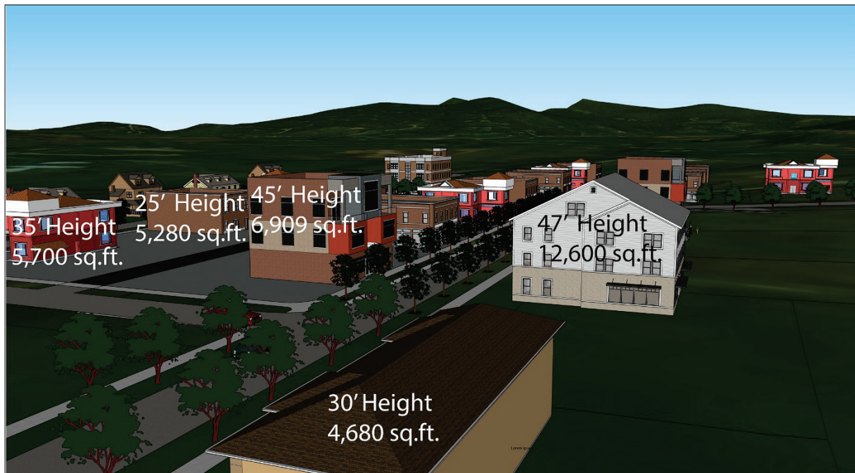
FIGURE 2: CONCEPTUAL BUILDING HEIGHTS

Buildings of all types could be multi-story (Jericho's zoning bylaw allows for a 35ft, or roughly 3 story building), with the potential for different uses within one building. For example, a building might have commercial uses on the first floor and office or residential on the second or third floor. Multi-story buildings help create a village-like sense of place, and with proper regulations they can be a way to encourage higher density without having large building footprints that consume excessive amounts of land (e.g. "big box" stores).