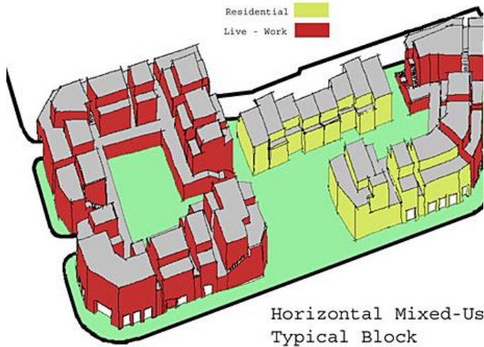
Horizontal Mixed-Use Typical Block

With the infinite number of various possibilities, these places combine vertical and horizontal use mixing in an area ideally within a 5 to 10 minute walking distance (a Pedestrian Shed) or quarter mile radius of a neighborhood center.