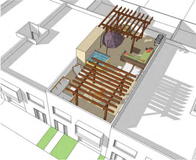
Rooftop Deck above Max. Building Height