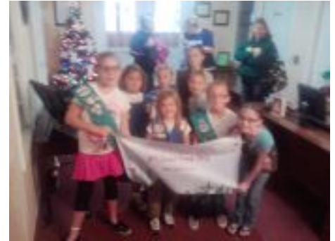
CHINA SPRING GIRL SCOUTS