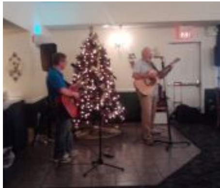
RON FRITZ - SILVER HAIRED POP & COUNTRY