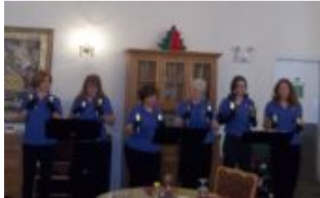
SPIRIT OF THE BELLS