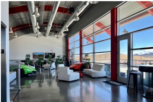
Interior Terrace – 900 sf – 80 guests