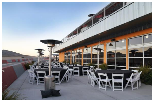
Exterior Terrace – 2500 sf – 200 guests