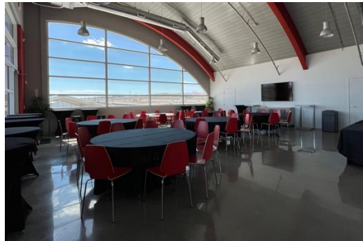
Champions' Room – 1156 sf – 130 guests