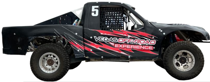
Baja Race Truck

275 HP 90 MPH Top speed 7 s from 0-60mph $150,000