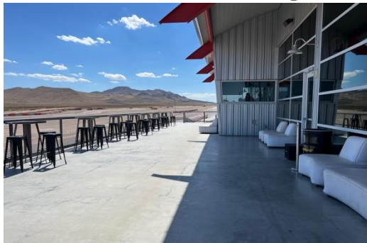
Exterior Terrace – 2500 sf – 200 guests