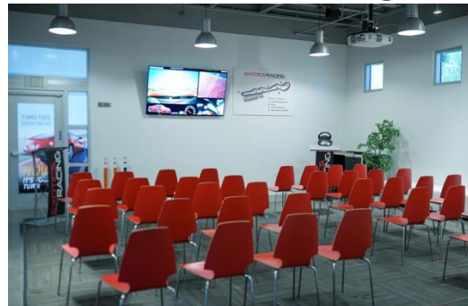
Briefing Room – 900 sf – 100