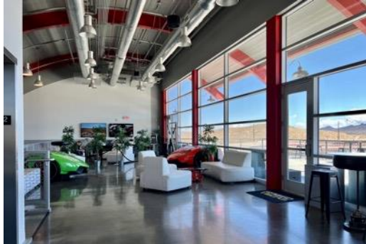
Interior Terrace – 900 sf – 80 guests