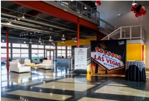
Driving Center – 4,350 sf – 600 guests