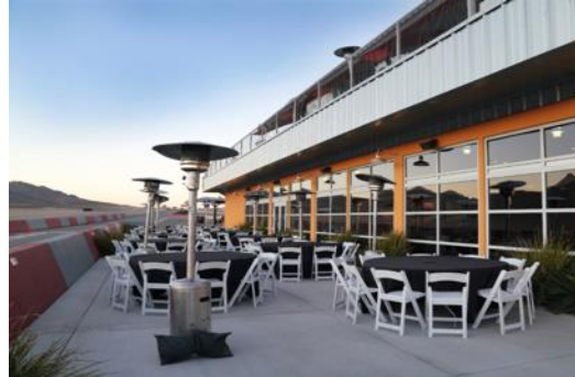
Exterior Terrace – 2500 sf – 200 guests