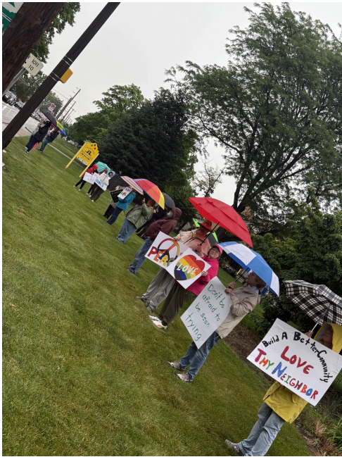
A little rain might have smudged the signs at our May 22 faithful witness, but it didn't dampen spirits!