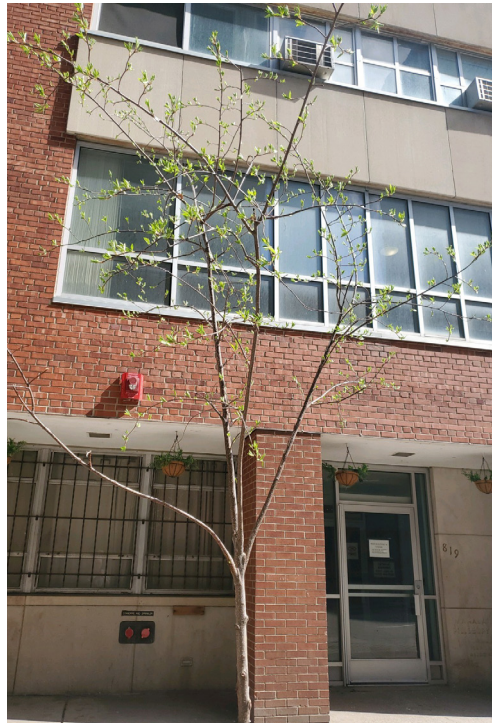
Trees around Exodus bloom displaying hope and life.