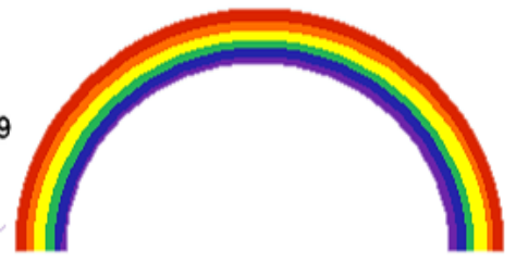
Rainbow Sign at corners