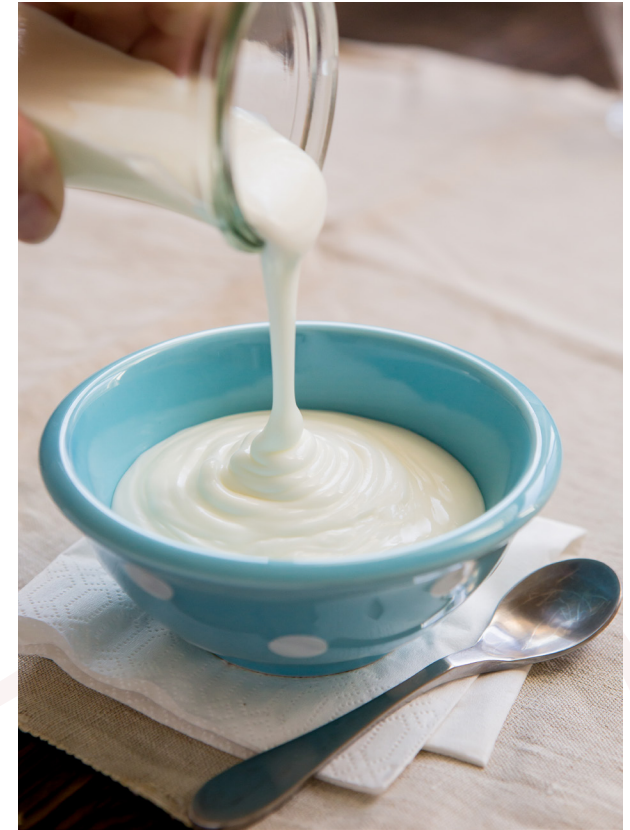
Yogurt contains about 5 billion of your closest friends.

Sidenote: If you like the fruity stuff, it's actually better for you (and way cheaper) to buy plain yogurt and add your own fresh fruit and honey. And it tastes a lot better! You can even mix it up a few days ahead of