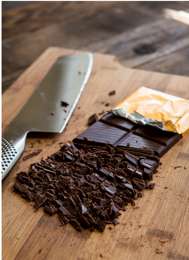
Chocolate is a girl's best friend.

First off, let's talk about the effects of chocolate on the brain. Besides a tiny bump of caffeine, which