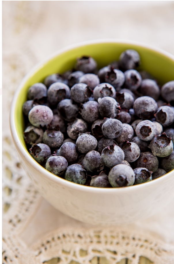
Meet Mother Nature's "Buffy the Vampire Slayer"

family tree. It's a downhill domino effect of biological drama.