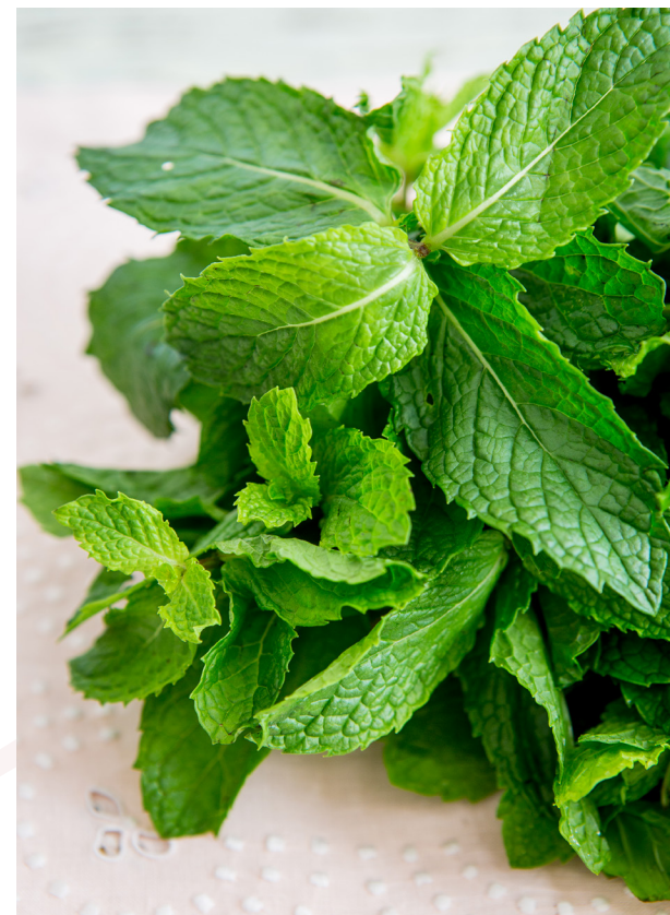
Fresh mint provides a nearly instant pick-me-up.

I've crafted a simple dinner recipe that is light and refreshing, with a big old kiss of mint to boot you out of any evening fatigue you may find yourself in. This bright pasta salad contains fresh mint for energy, lemon for a sunny disposition, green peas for a shot of chlorophyll and happy antioxidants, and cheese for a generous helping of protein. If you'd like to lighten this dish up a little more, feel