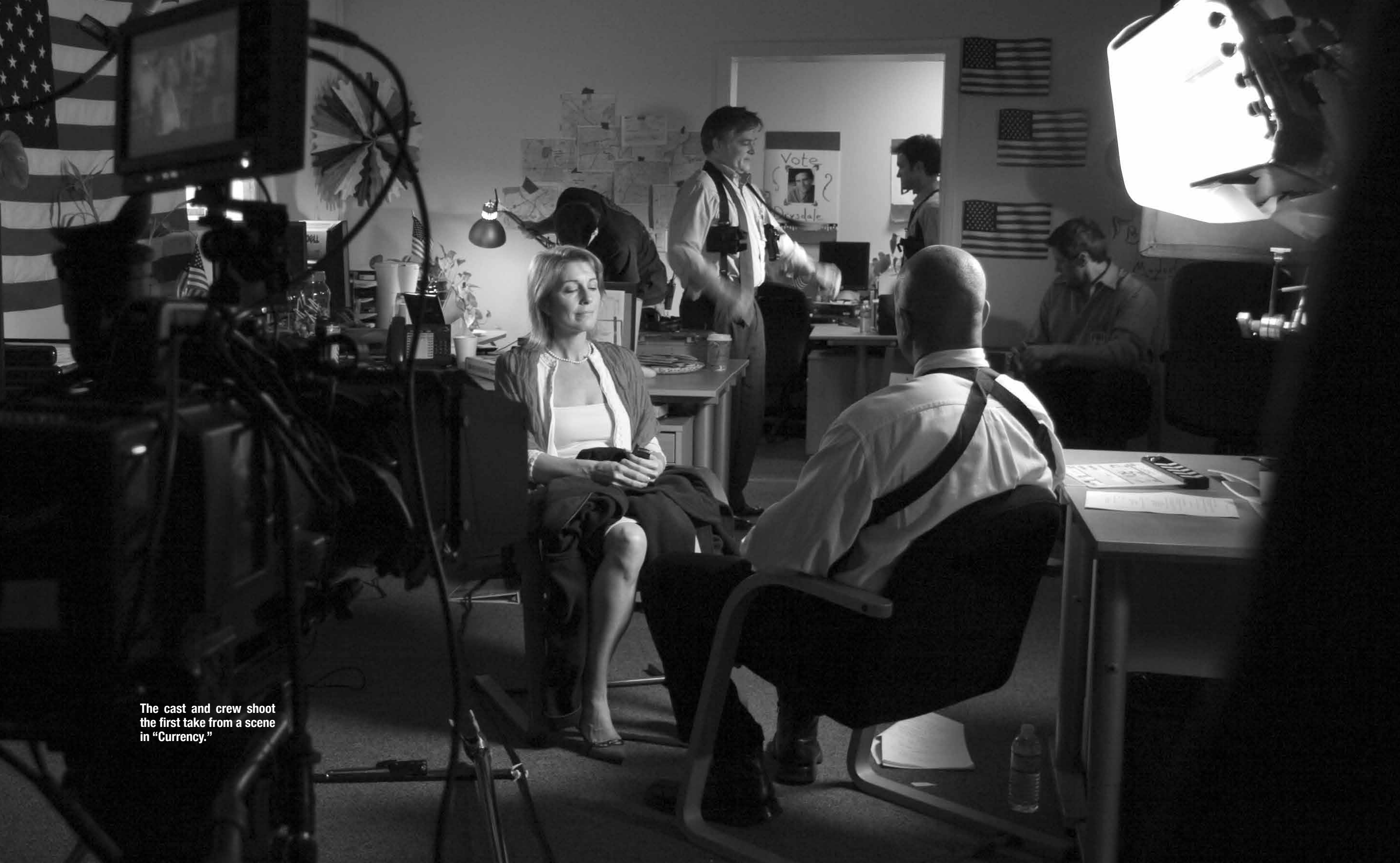
The cast and crew shoot the first take from a scene in "Currency."