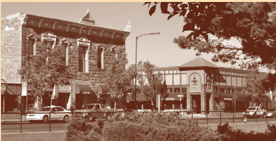
Photo B: (Top): Looking east on Front St. (now Route 66) and Leroux St., circa 1900. The Arizona Central Bank and Hotel is on the far left. Photo C (Bottom): Route 66 and Leroux St. today.

As the rails neared the San Francisco Peaks, a small settlement began to take shape by a small spring on the slope of what is now called Observatory Mesa (or Mars Hill), just west of today’s downtown Flagstaff. In early 1881, merchants and saloonkeepers set up shop for the advance parties of workers who were coming to grade and cut ties in the abundant Ponderosa forest. That same year the citizens of the little camp called their new town Flagstaff, in honor of the landmark. By the fall of that year, Flagstaff boasted a population of 200 and swiftly became a wild railroad town filled with saloons, dance halls and gambling houses.