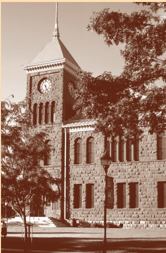
Photo D (Left): Coconino County Courthouse, circa 1894, one year after completion. Photo E (Right): The Courthouse today.