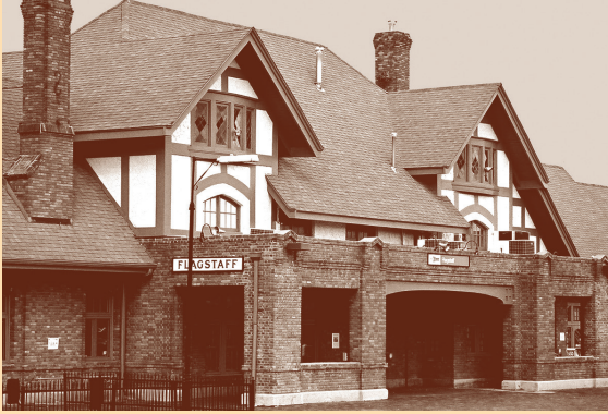
The historic Flagstaff Train Station built in 1926 is still in use today. It is the current home of the Flagstaff Visitor Center.