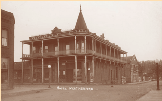
Photo F: The Hotel Weatherford (center), and the Orpheum Theater (right) on the corner of Leroux St. and Aspen Ave., circa 1890-1910.

Old Town had water, but New Town had commerce and soon outgrew the older settlement. In 1884, a devastating fire burned down many of Old Town’s buildings and New Town became the one and only Flagstaff. Its center was the intersection of Front and San Francisco Streets. Later Front Street would be called Railroad Avenue, but in 1926, the road became part of Route 66 and was renamed Santa Fe Avenue. In 1993, the road was renamed for the historic Route 66, and it continues to be a major thoroughfare of the city.