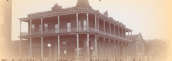
Weatherford Hotel, circa 1890

While the other spirits are quiet and benign, the last of the apparitions most definitely is not. The ghost of a very angry young man stays near the north stairway to the basement. He has a history of violent behavior, and has scared the wits out of many of the staff. It is very possible this is the spirit of a man who, in the late 1970s, hung himself from the loading dock at the top of the stairway—this apparition was never reported until after this event took place.