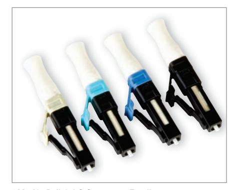
3M™ No Polish LC Connector Family