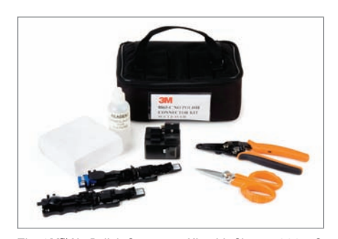
The 3M™ No Polish Connector Kit with Cleaver 8865-C includes all tools necessary for installation.