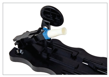
Close up of 3M^{\mbox{\tiny M}} No Polish LC Connector Assembly Tool 250/900 8835-AT