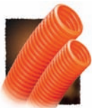
Corrugated HDPE (typically, multiple runs inside main conduit)