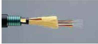
Steel Armor/Polyethylene Overjacket Construction for Rodent and Lightning Protection